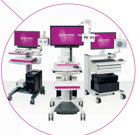
Customised solutions for support arms, carts and accessories

NEUROWERK CENTER is the foundation of our NEUROWERK EMG and EEG systems. Thanks to a powerful SQL database, NEUROWERK CENTER provides easy access to all aspects of our systems. Users can manage and save all examination results, both EMG and EEG, over the long term. It has never been easier to share test results, reports and findings via an HL7 or GDT interface, or to export them as PDF documents. Data is protected from unauthorized access by integrated user management functions.