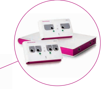
Stimulator unit and EMG amplifier with 2 or 4 channels