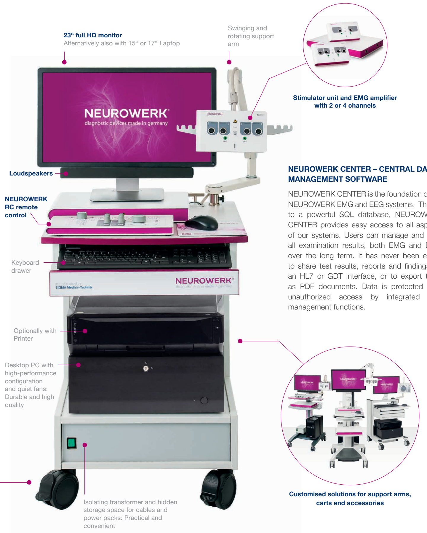
23" full HD monitor Alternatively also with 15" or 17" Laptop